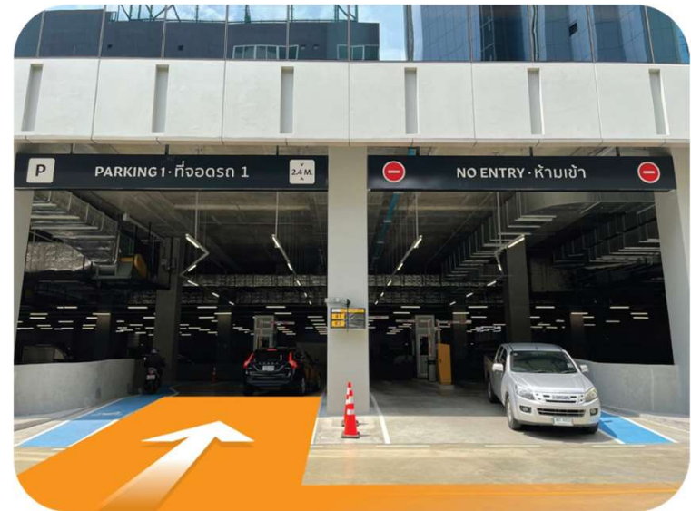
Parking 1 is on the right side.