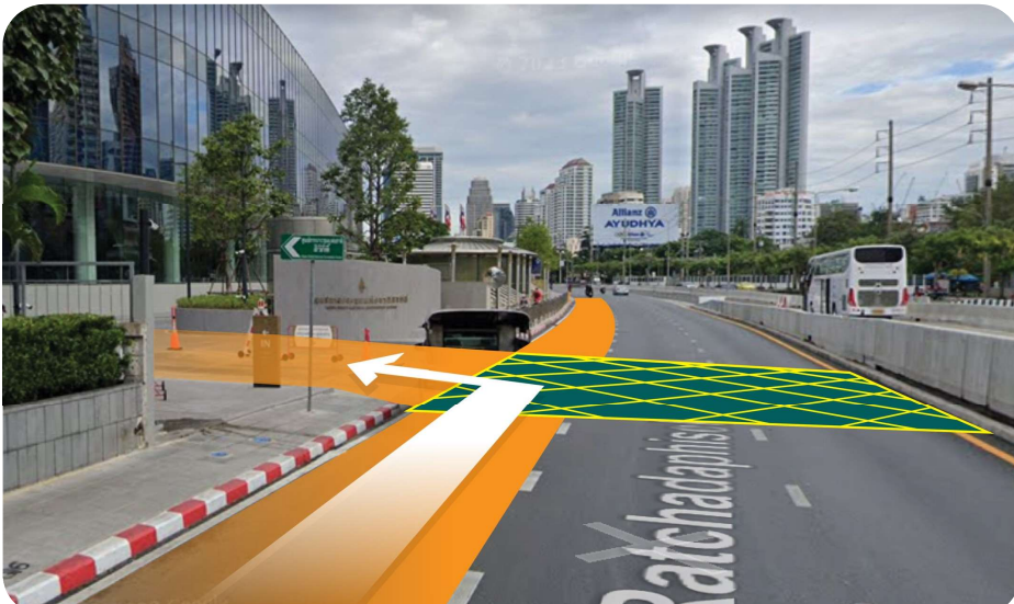
Gate 1 from Ratchadaphisek Road.