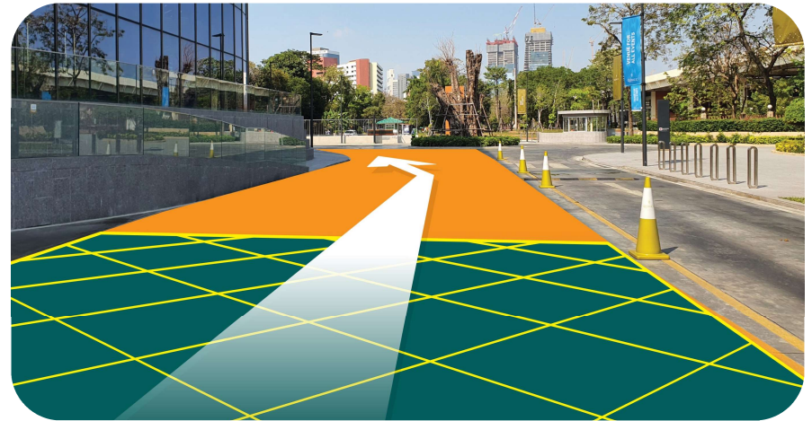
Go straight and turn left at the roundabout.