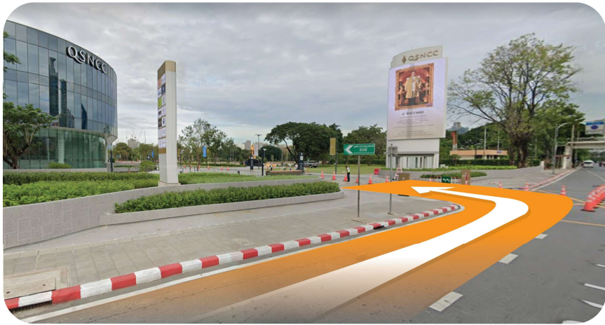
Gate 2 from Ratchadaphisek Road.